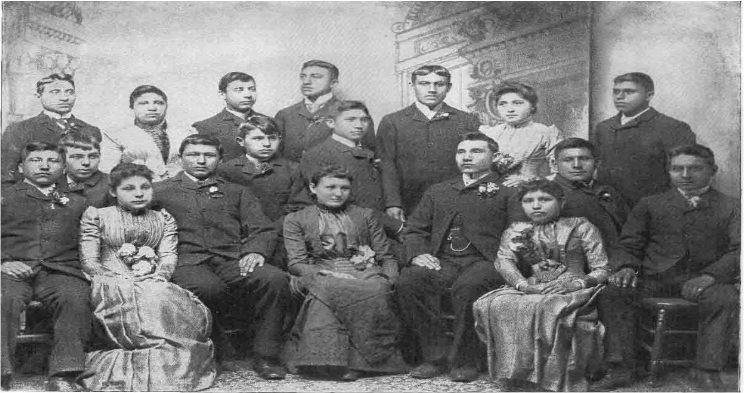
EDUCATING THE INDIAN RACE. GRADUATING CLASS OF CARLISLE, PA.