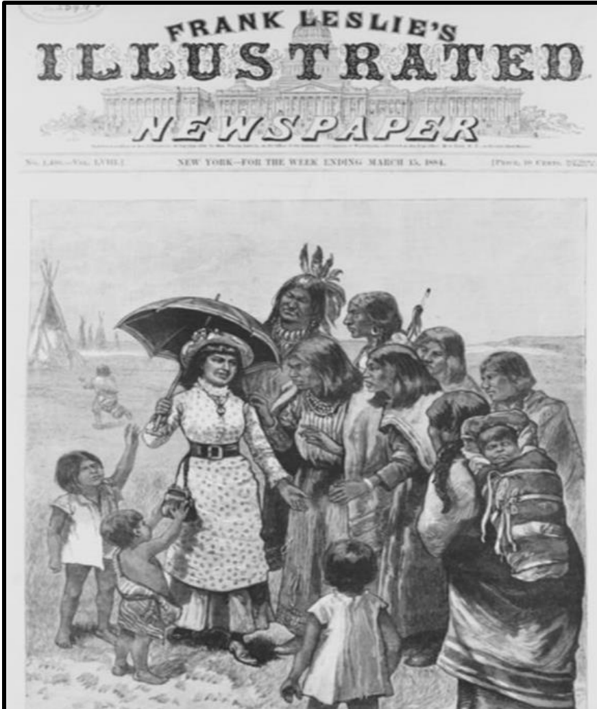
Educating the Indians--a female pupil of the government school at Carlisle visits her home at Pine Ridge Agency

Frank Leslie's Illustrated Newspaper , established in 1855, was the first successful pictorial newspaper in the United States. By 1860, Leslie's had a circulation of 164,000. The following picture appeared on the cover of the March 15, 1884, Edition. The newspaper stopped circulation in 1922.