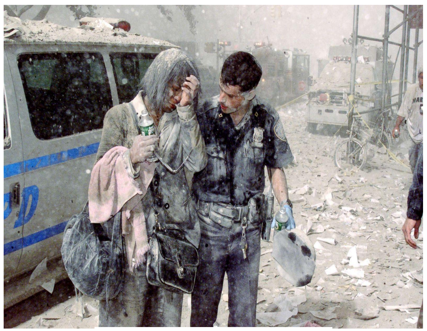
WE WILL NEVER FORGET 9/11/2001